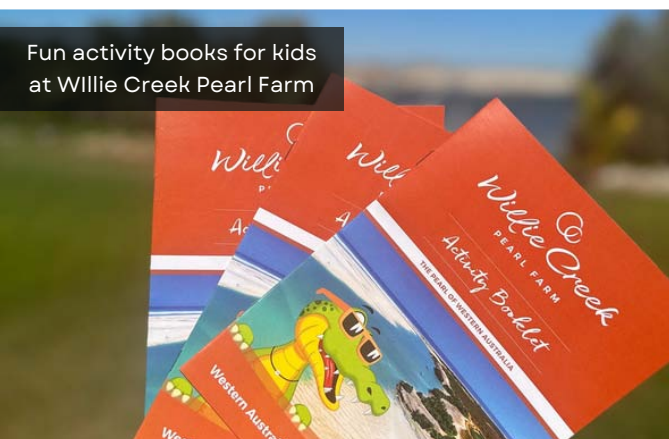
Fun activity books for kids at Willie Creek Pearl Farm