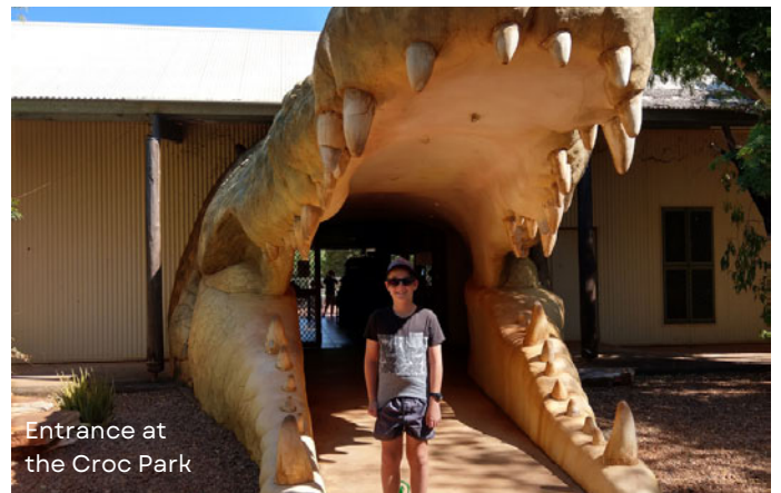
Entrance at the Croc Park

Visit the Malcolm Douglas Crocodile Park (18km's out of Broome) at feeding time and watch your children's amazed faces as they come face to face (but not too close!) with a variety of crocodiles which includes freshies and Salties plus American alligators and have the opportunity of holding a baby croc. Open from 2-5pm daily, with crocodile feeding at 3pm.