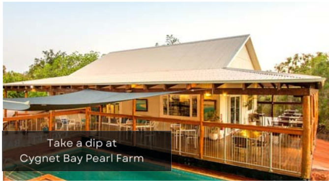
Take a dip at Cygnet Bay Pearl Farm

Learn about our rich pearling history with Willie Creek Pearl Farm or head further up the Dampier Peninsula to the Cygnet Bay Pearl Farm to experience the step by step process out pearls go through from water to shop. These tours will include the history of our pearling industry, a live pearl harvest, learn about how the pearls grow, as well as the grading process.