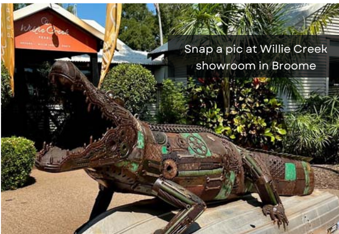
Snap a pic at Willie Creek showroom in Broome