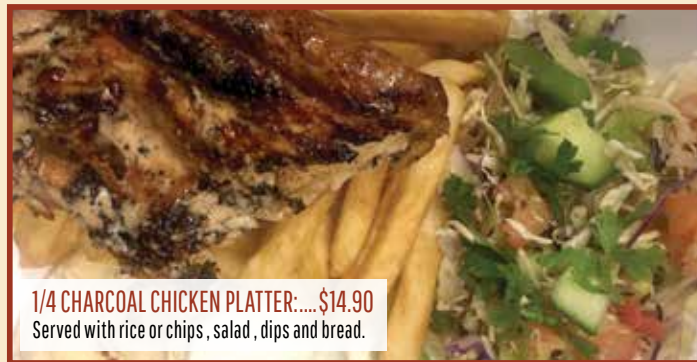
1/4 CHARCOAL CHICKEN PLATTER:.....$14.90 Served with rice or chips, salad, dips and bread.

Mozzarella cheese, prawns, barramundi strips, calamari, fresh tomatoes, garlic, fresh parsley & red onion.